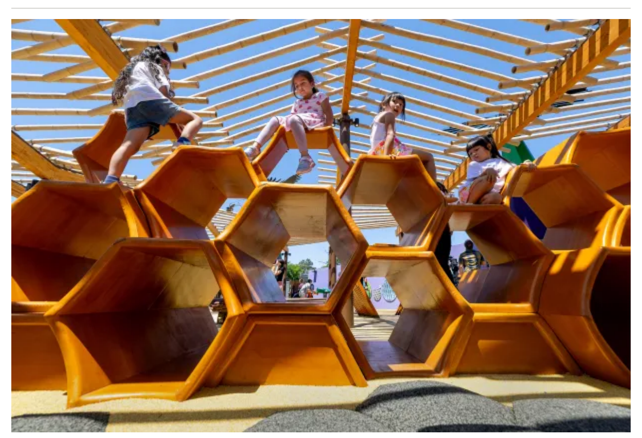
Children's Discovery Museum of San Jose debuted their outdoor Exploration Portal with preschoolers from Educare California at Silicon Valley taking the honeycomb exhibit for a test run, Friday, June 21, 2024, in San Jose, Calif.