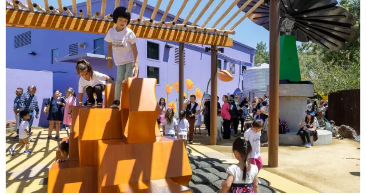
Children's Discovery Museum of San Jose debuted their outdoor Exploration Portal with preschoolers from Educare California at Silicon Valley taking the honeycomb exhibit for a test run, Friday, June 21, 2024, in San Jose, Calif.